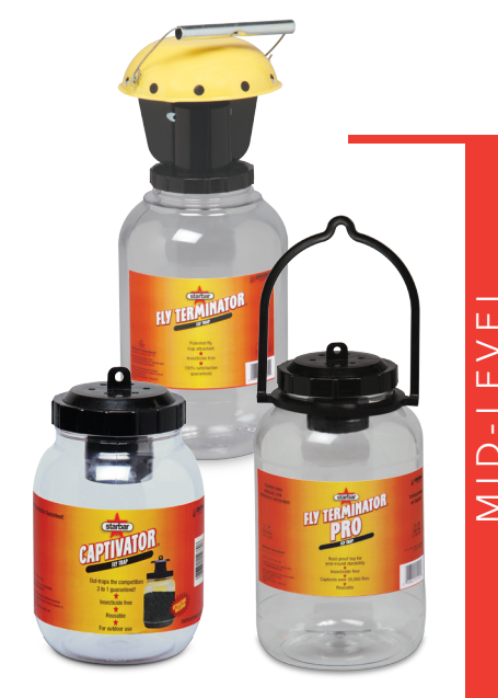
Odor & Pheromone Traps

Not for indoor use, nor for use against biting flies. Contents may give off bad odor; do not allow contents to contact hands or clothing.